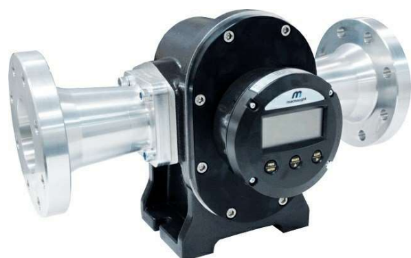
MX100F-1SF Digital Register